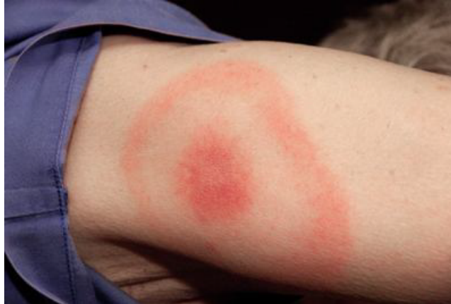
The rash, 'erythema chronicum migrans' which can develop within 3 to 32 days after being bitten with an infected tick.