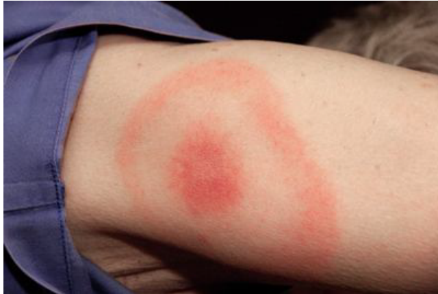
The rash, 'erythema chronicum migrans' which may develop within 3 to 32 days after being bitten with an infected tick.

Lyme disease affects different areas of the body in varying degrees as it progresses. In most patients, (but not all), the classic sign of early local infection is a circular, outwardly expanding rash called erythema chronicum migrans . This occurs at the site of the tick bite 3 to 32 days after being bitten. The rash is red, and may be warm, but is generally painless. ( Be aware that Lyme disease can progress to later stages even in patients who do not develop a rash. )